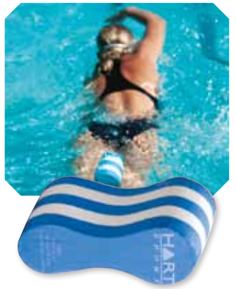
HART Pull Buoy - 5 Layer Five layer combo. Shaped for comfort. Size: 24cm(L) x 15cm(H) x 9cm(D) 18-410-L ea $7.50